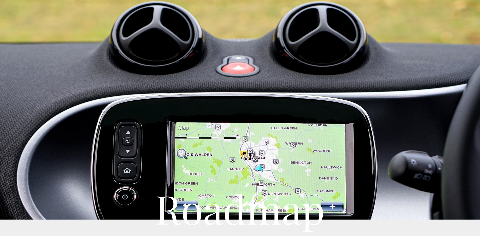
Creation of companion app, creation of Shopify app, non-Wordpress backend (2019)