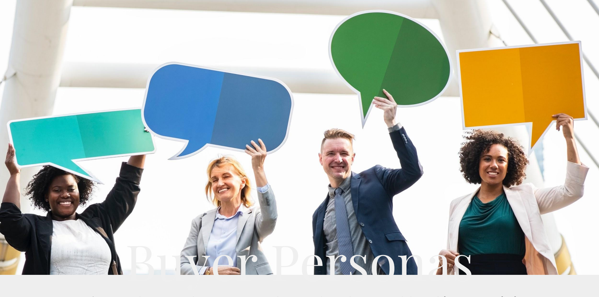
target markets are: luxury real estate, any real estate (on a larger scale), architects, touristic agents