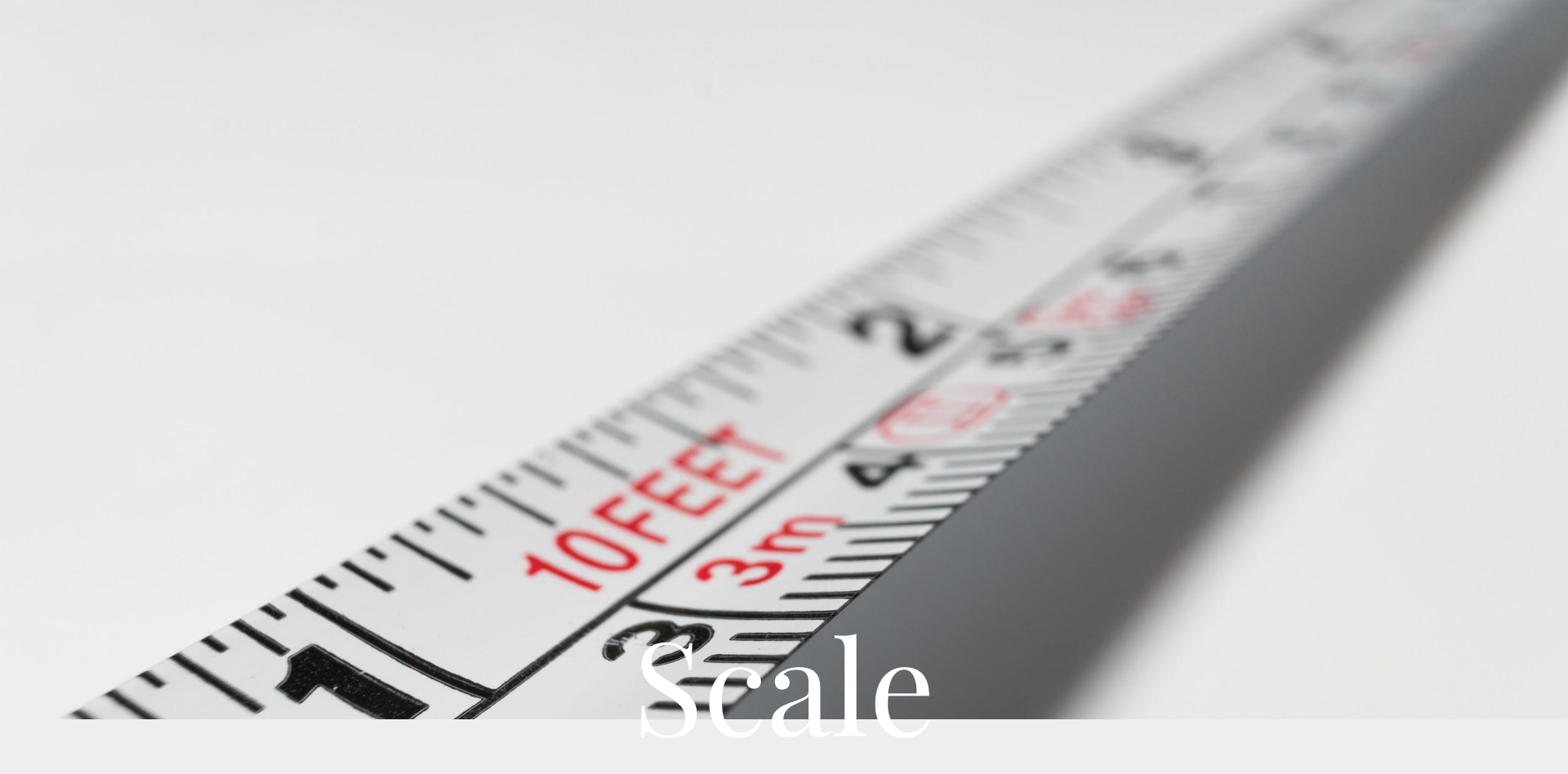
Soulvu is built to scale : the bigger the scale, the lower the cost per tour